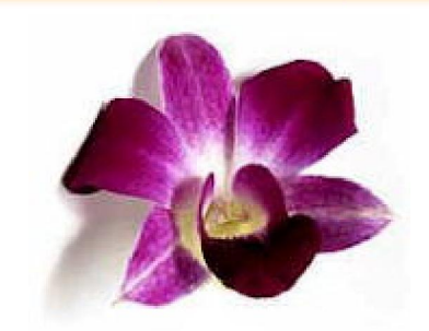
Serenity House Logo.