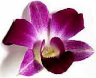
Serenity House Logo.